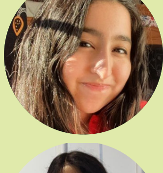
EQUALITY AND DIVERSITY OFFICER.